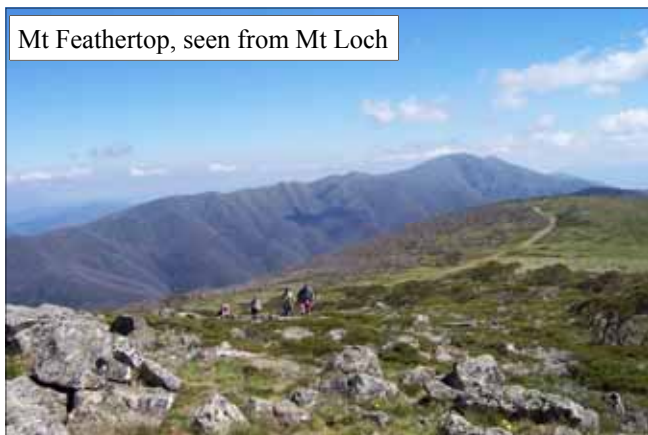
Mt Feathertop, seen from Mt Loch

Why don't you join us? These walks are just perfect for clearing your head of urban noises and smog to allow for the sights, sounds and smells of nature to soak in. Energetic walks are invigorating and help you escape the stresses of everyday life.