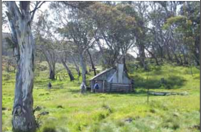
Guys Hut features traditional log construction